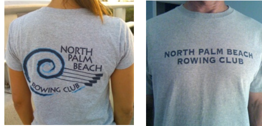
Left: Back/Women's fit

NPBRC's own heather grey all-time best workout shirt. Club logo on back, club name in navy blue on the front. Available in men's cut or a fitted women's cut w/ cap sleeve.