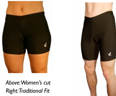
Above: Women's cut

JL Racing polypropylene rowing trou in black. Available in traditional (Unisex) or new women's cut (1-1.5" shorter inseam than men's trou).